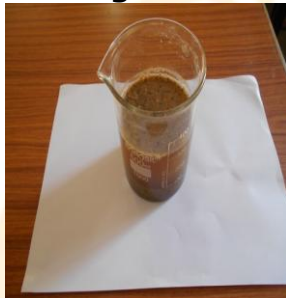
Triphala Yavakuta Churna Soaked