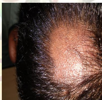
After 10 days of the treatment