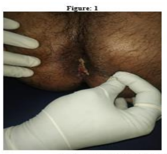
Case 1- Palashaksharasutra in situ before & during treatment of Bhagandara