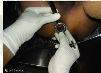
After complete recovery