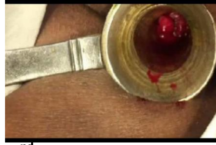
2 nd degree pile mass with Bleeding

Application of Rajani Lepa found effective in this 2 nd degree internal haemorrhoids within 15days the patient was followed up regularly and by doing proctoscopic examinations in each visit and there is no evidence of recurrence of bleding Haemorrhoid, patient was on active treatment for 2months ,diet restriction followed. Combination of Rajani Lepa , conservative treatment, diet restriction and lifestyle modification over a period of 1 year.